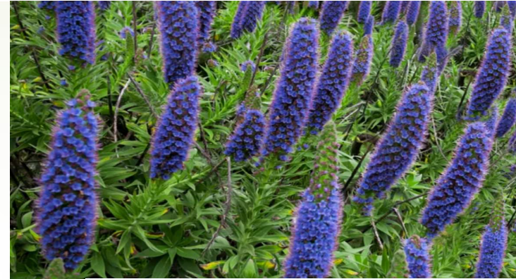
Geographic subdivisions for Echium candicans : CCo, SnFrB, SCo, s SnGb

**Pronunciation: Echium (EK-ee-um) candicans (KAN-dee-kans)