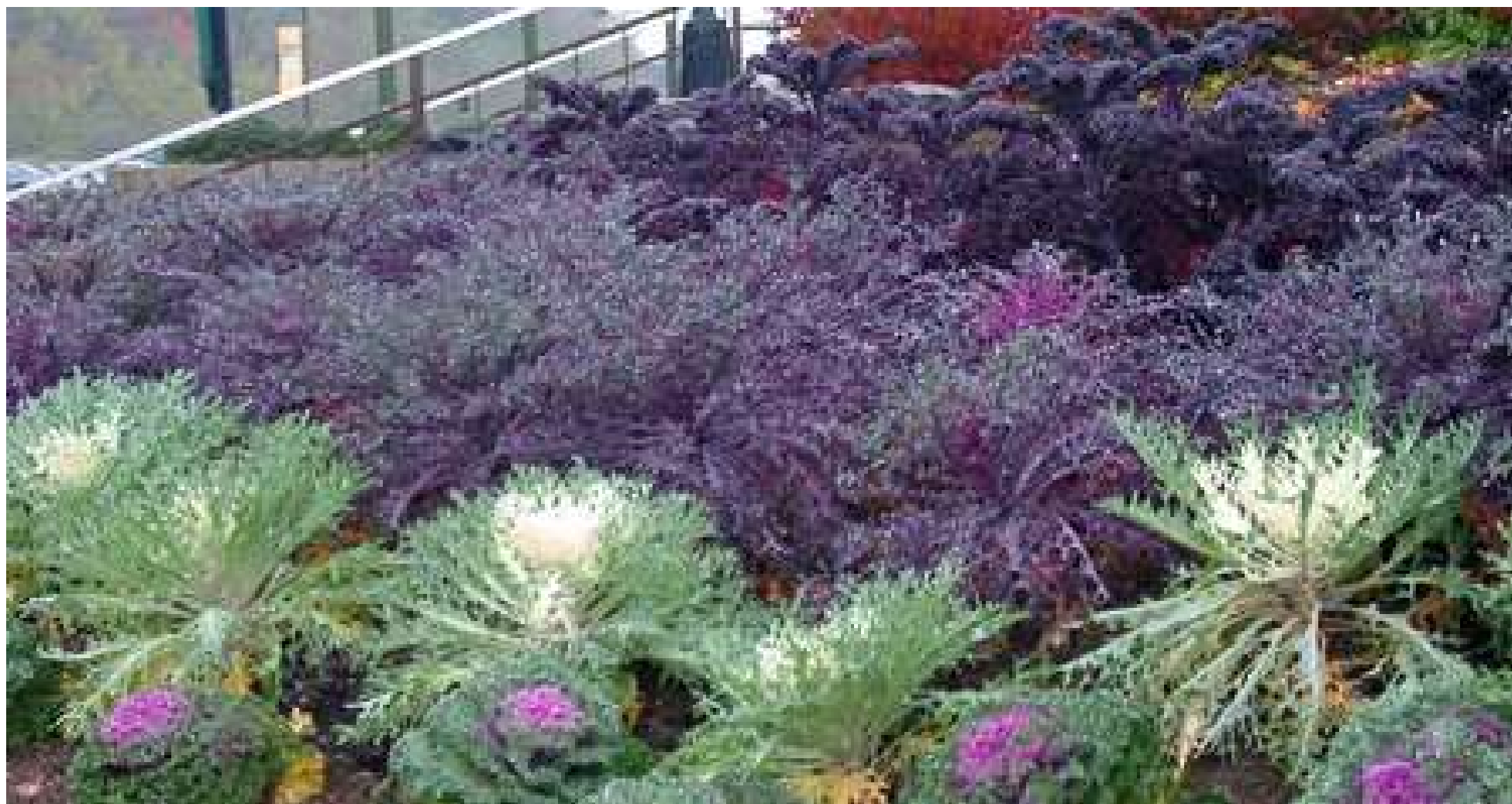
Ornamental Cabbage and Kale