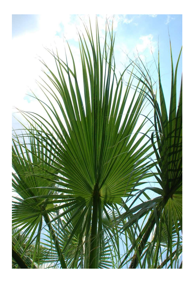
Mediterranean Fan Palm