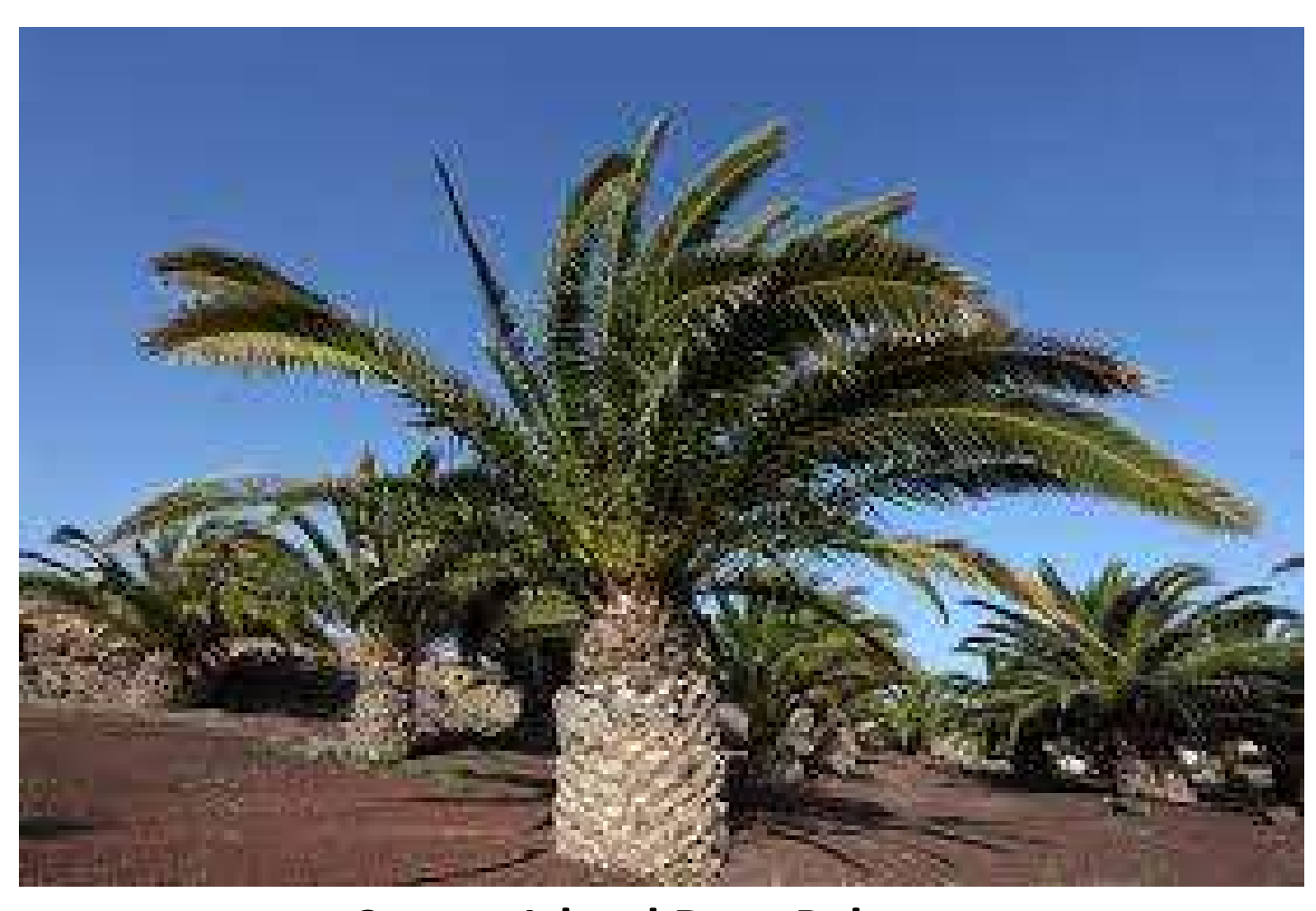
Canary Island Date Palm