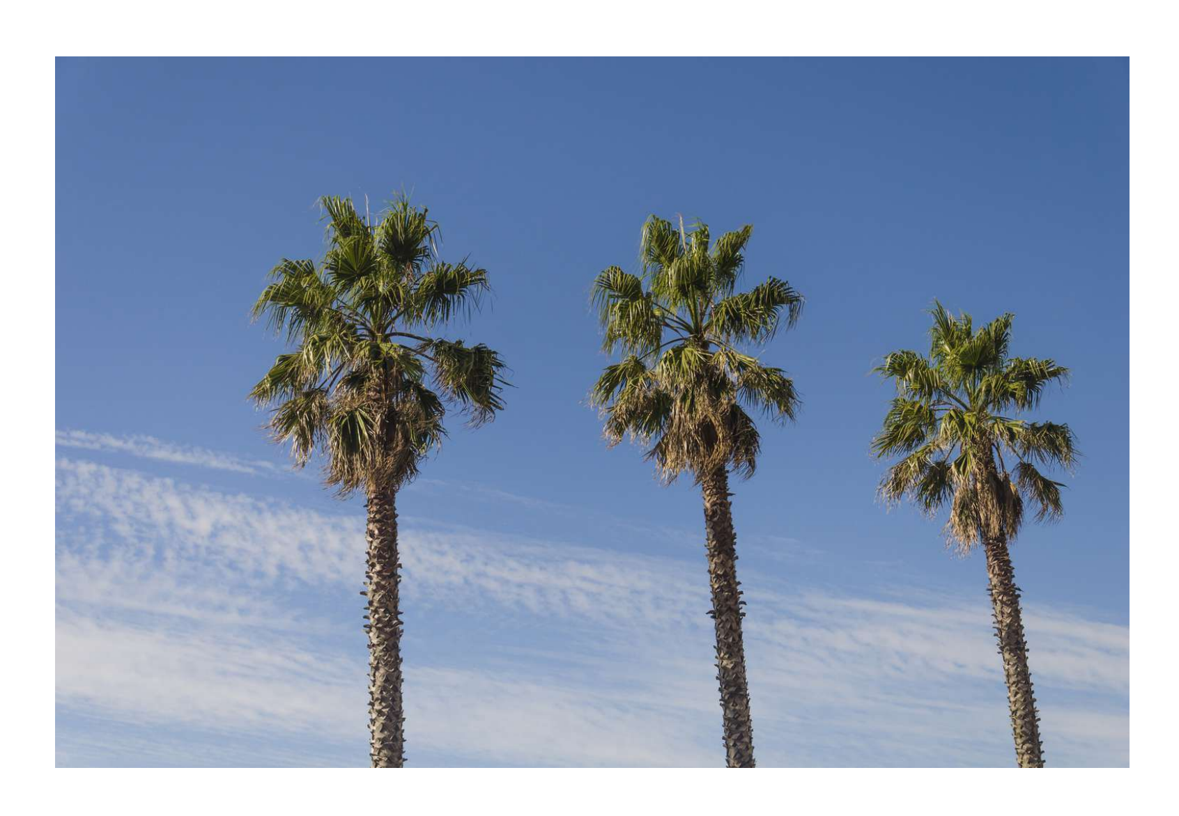
Mexican fan palm