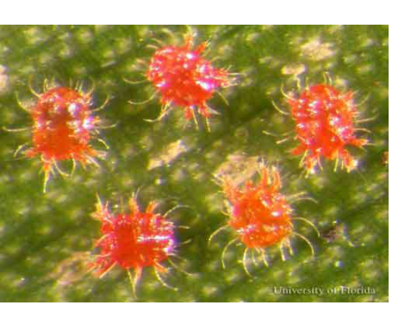
Red palm mite