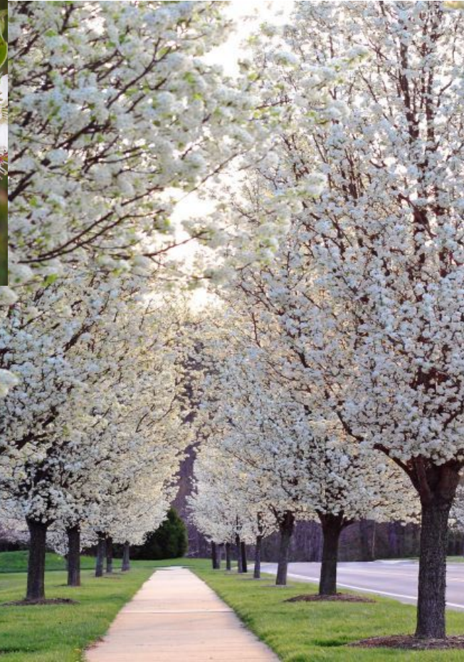
Pyrus calleryana Cleveland (Flowering Pear)