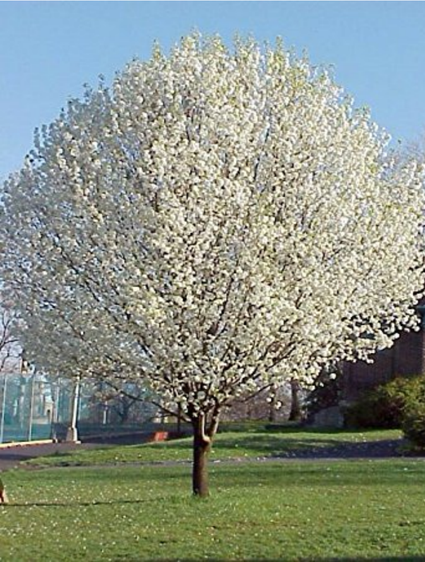
Pyrus calleryana Bradford (Flowering Pear)