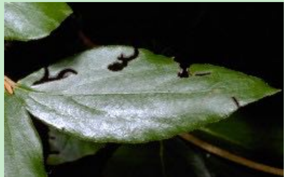
Black Vine Weevil Droppings