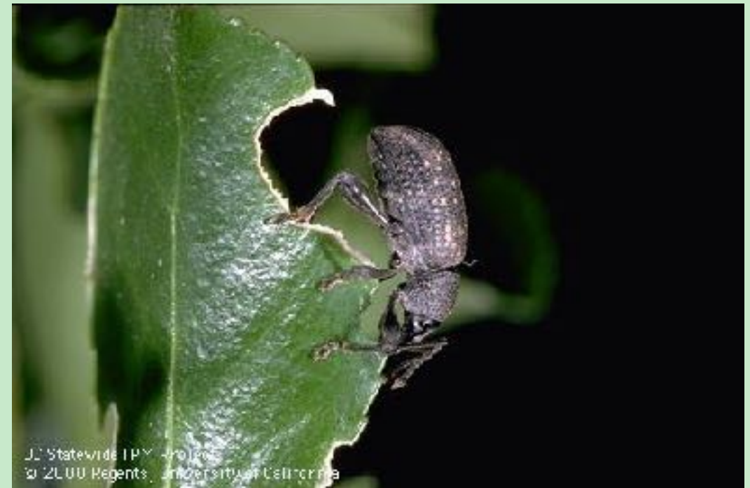
Black Vine Weevil Adult Feeding