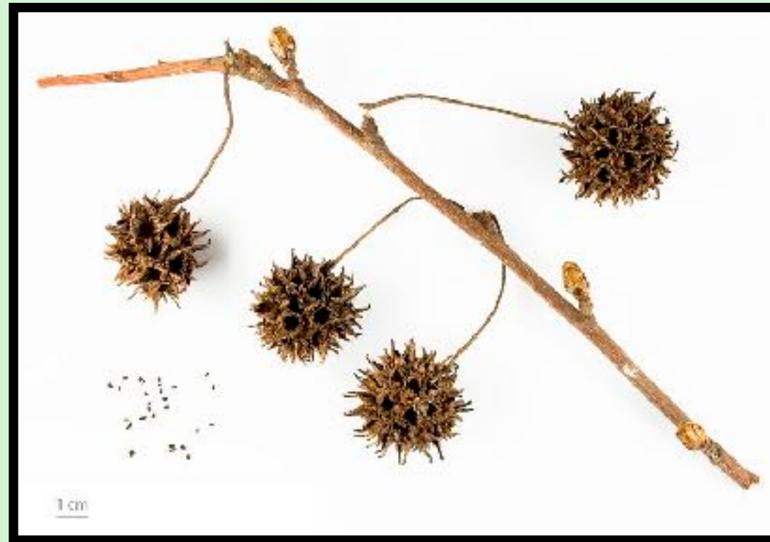
Mature Fruit and Seeds