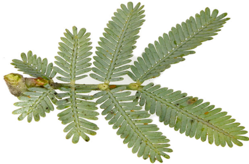
Image 4 of 15 - Acacia baileyana - leaf-close-up