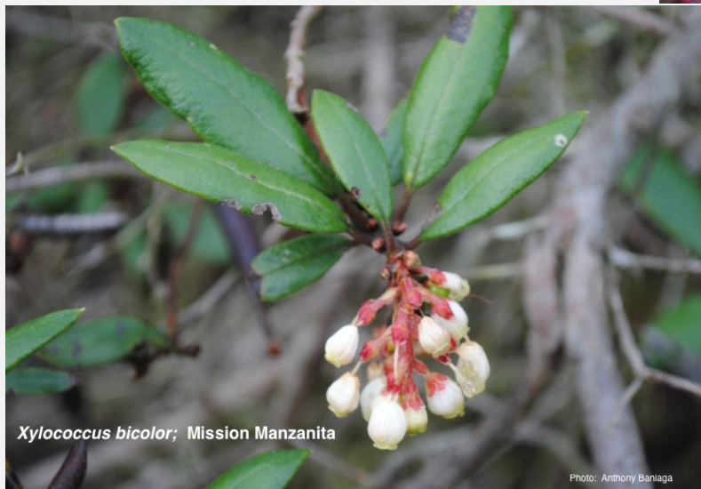
Xylococcus bicolor ; Mission Manzanita