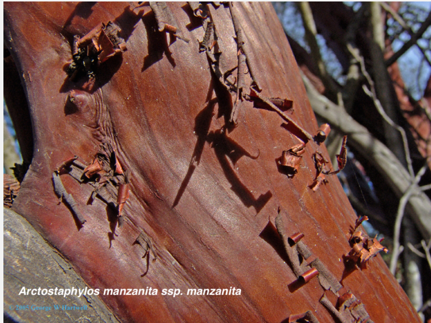
Arctostaphylos manzanita ssp. manzanita