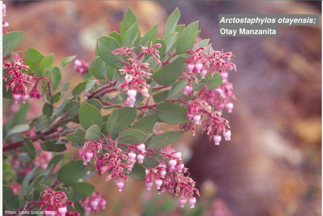
Arctostaphylos otayensis ; Otay Manzanita