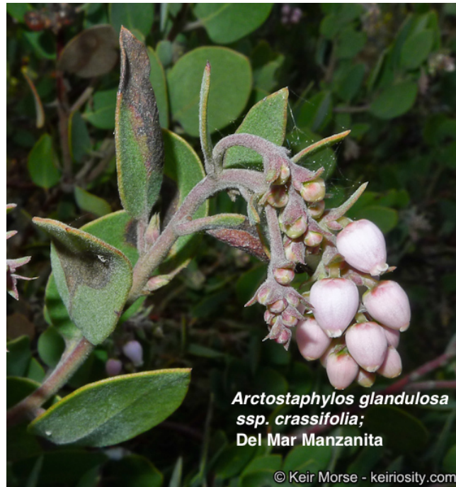
Arctostaphylos glandulosa ssp. crassifolia ; Del Mar Manzanita