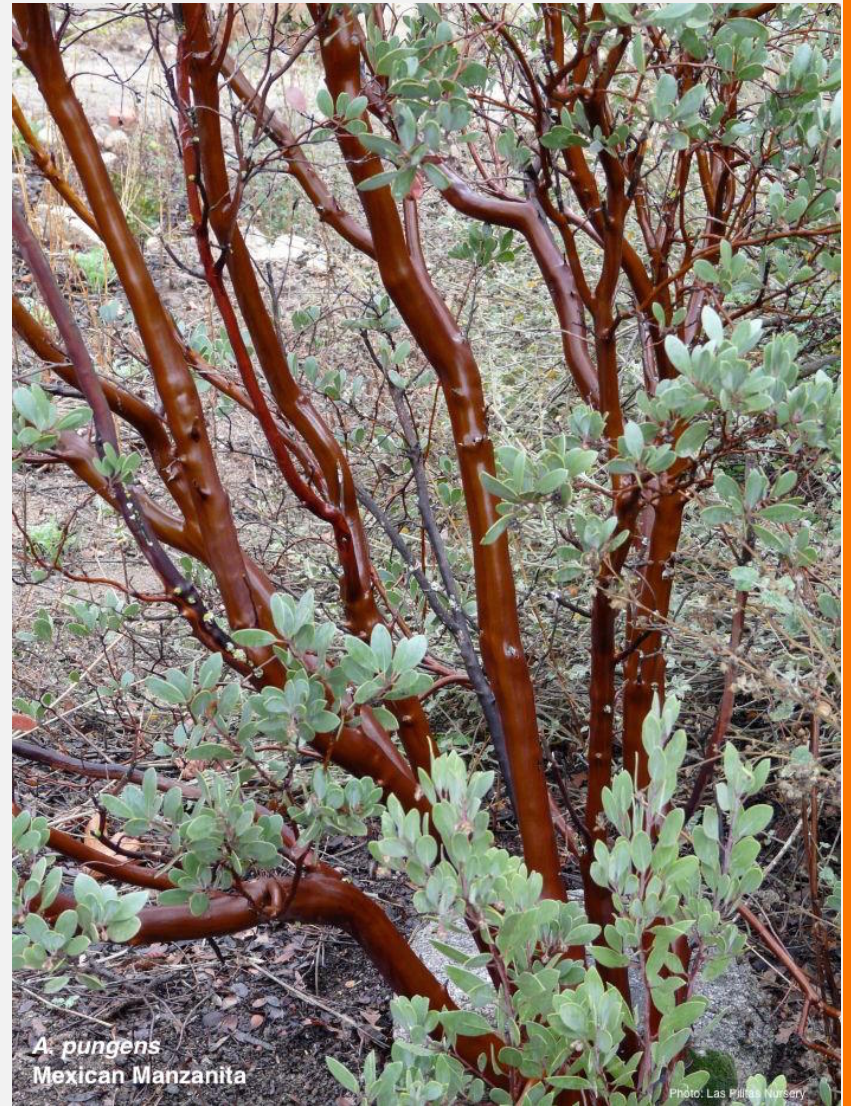
A. pungens Mexican Manzanita