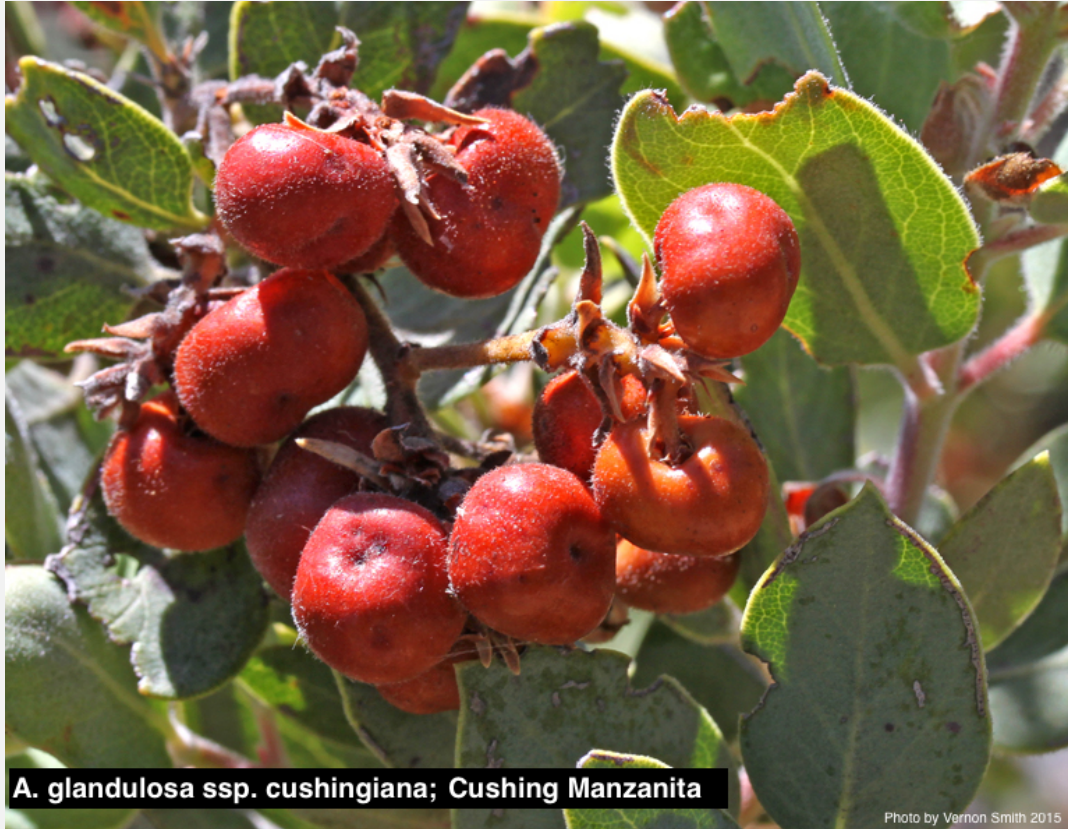
A. glandulosa ssp. cushingiana ; Cushing Manzanita