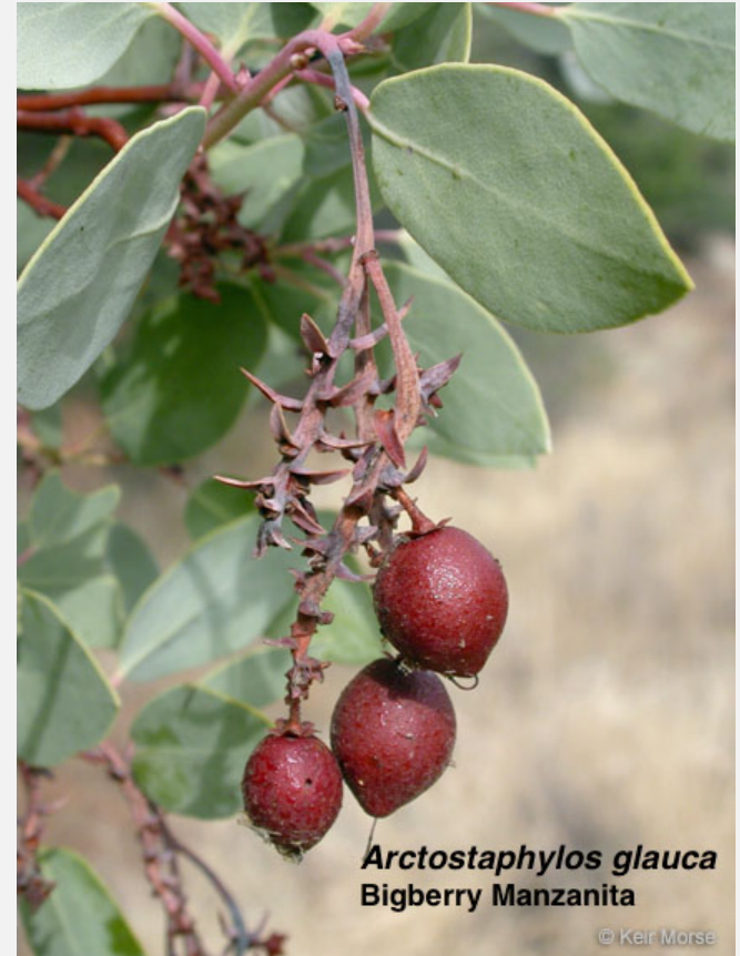
Arctostaphylos glauca Bigberry Manzanita