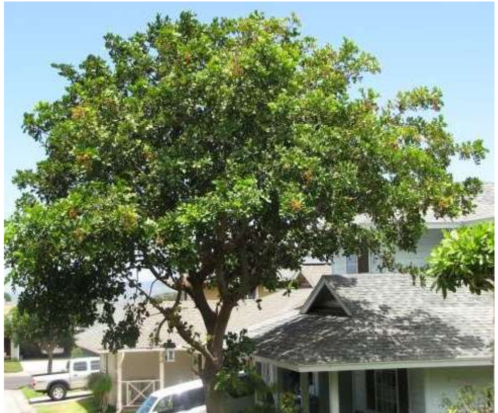
Cupaniopsis anacardioides - Carrotwood Tree