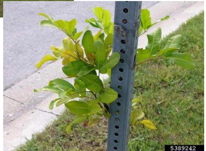
Cupaniopsis anacardioides - Carrotwood Tree