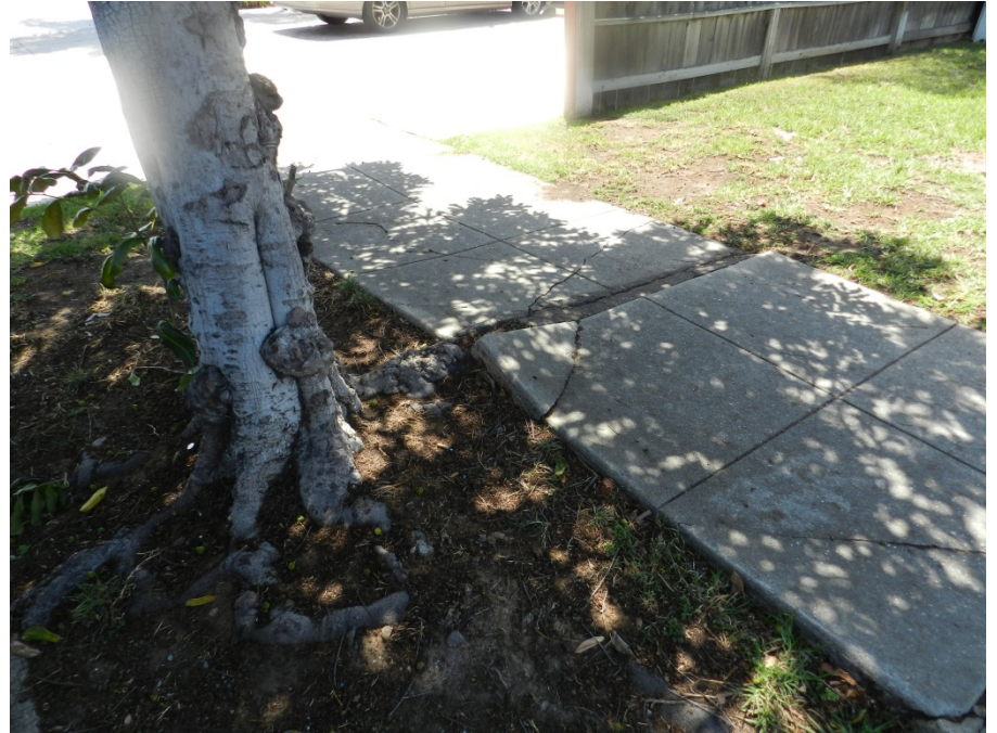
Cupaniopsis anacardioides - Carrotwood Tree